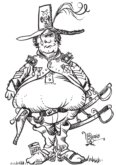
Authentic Civil War Lt. Arty. Reenactor