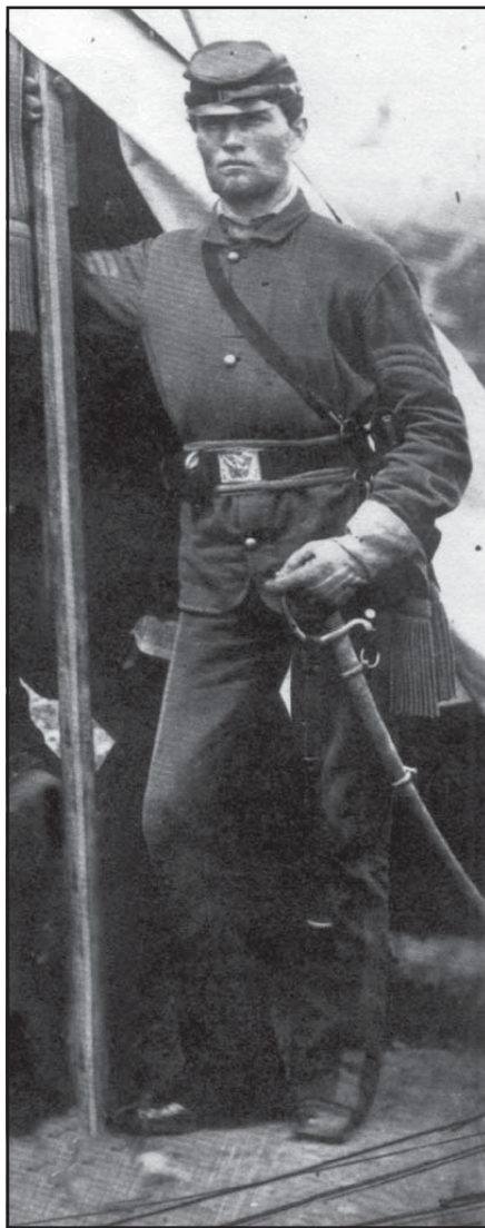
Neatly hemmed Federal Artillery Sgt., c. 1863.