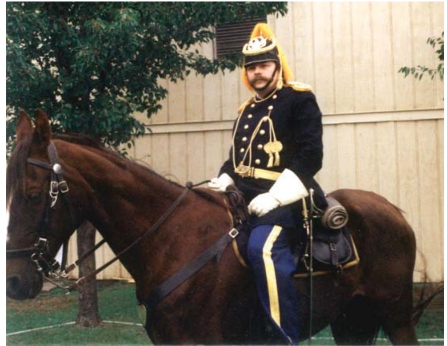
IW# 16 M1872 Officer's Dress Uniform. Helmet made by F. Burgess & Co. An unknown officer of the U.S. 7th Cavalry in full dress. 1872-1881.

IW:14 Officer's Pillbox Cap: Dark blue, round body, black leather sweatband, black leather chin strap, gold false chinstrap across peak, black satin lining. Worn in garrison and field. $40.00