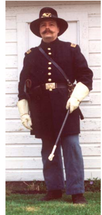
CWF# 26 M1861 Officer's Trousers & CWF# 8 Frock Coat. Capt. of Inf.