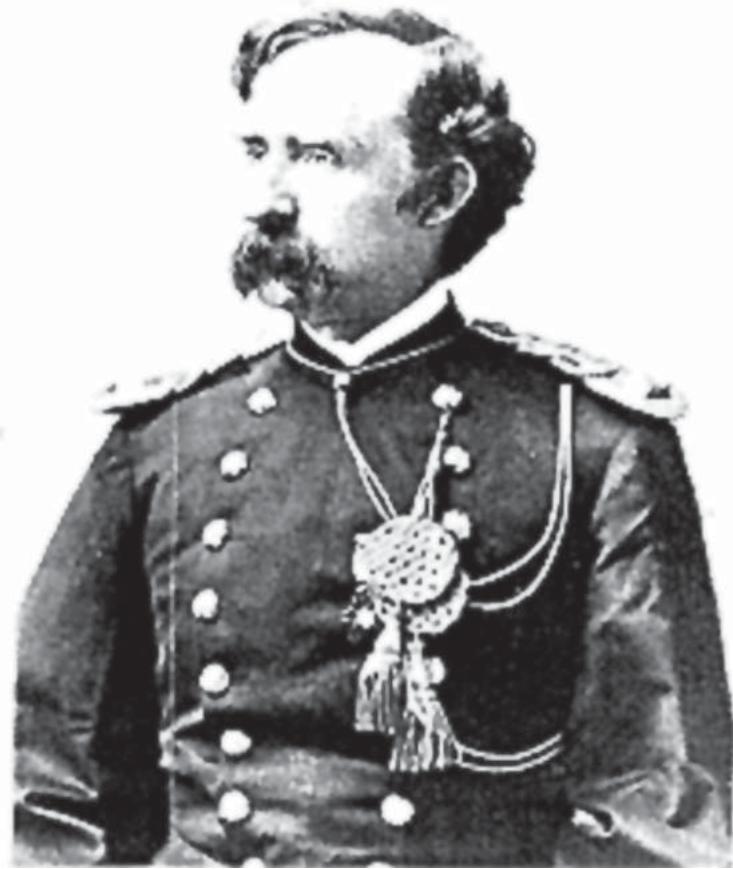
At the regimental Christmas Party at Ft. A. Lincoln, Dec. 21, 1875, Lt. Col. G.A. Custer complained bitterly about his deteriorating dress uniform, saying "...I should have gotten it from Civil Wardrobe! Those other ruffians, it seems, caught me napping!"