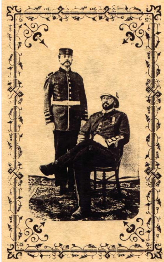
Seated: BE# 16 M1831 Highland Officer's Tunic.