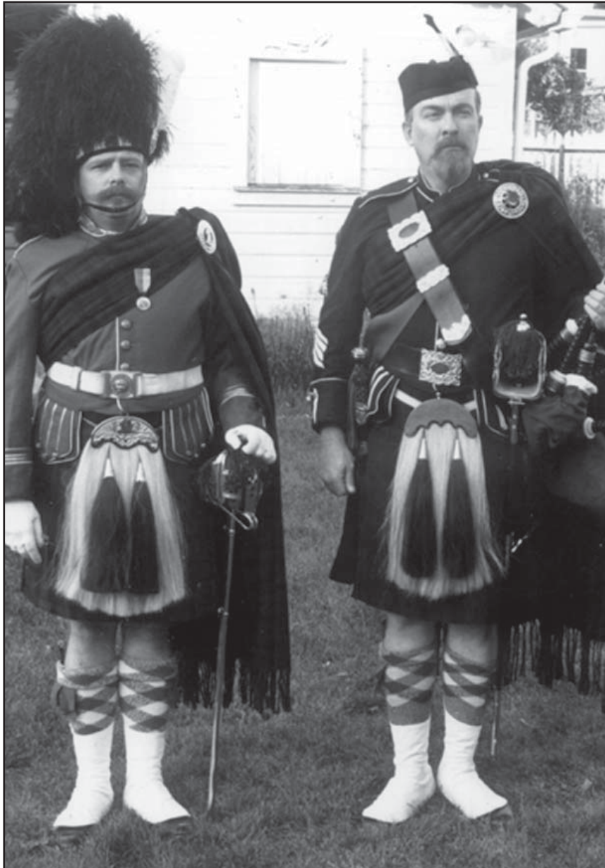
L: BE#19, M1868 Highland Officer's Dress Doublet. R: BE# 21, M1856 Piper's Dress Doublet. Officer and Pipe Major, 93rd (Sutherland Highlanders) Reg.