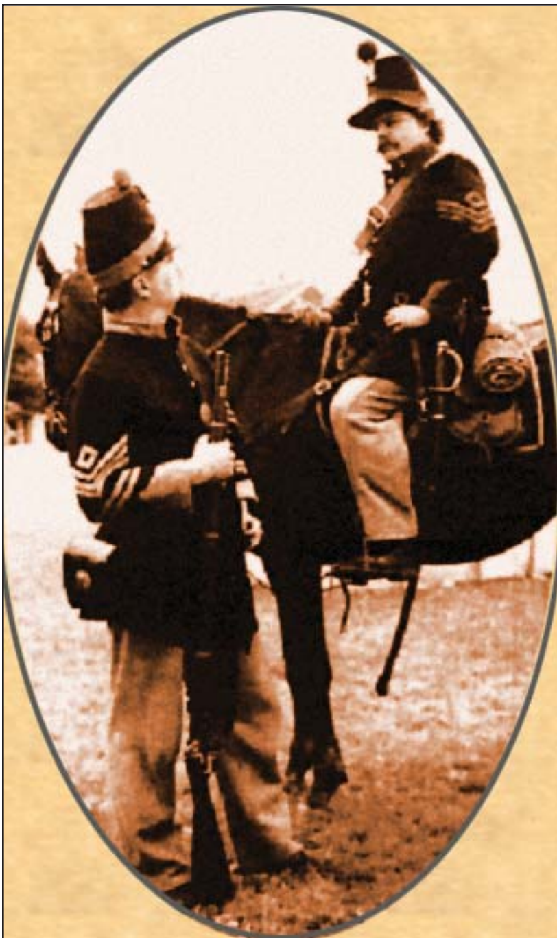
1st Sgt., 5th U.S. Infantry 1st Sgt., 2nd U.S. Dragoons (mounted)