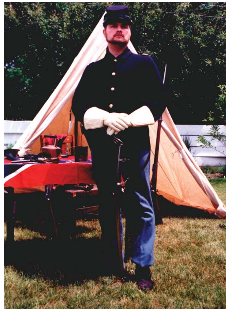
CWF # 4: Officer's Fatigue Blouse. Sgt. Quincannon is promoted to 1st. Lt. after saving Col. Smegmovsky's 2nd Volunteer Caterers Regiment at Fredericksburg, 1862.

CSA:11 General Officer's Kepi: Chasseur style kepi. Dark blue wool with 4 rows of braid. Leather sweatband, bound black leather visor, black leather chinstrap secured with 2 brass CSA Staff buttons. $100.00