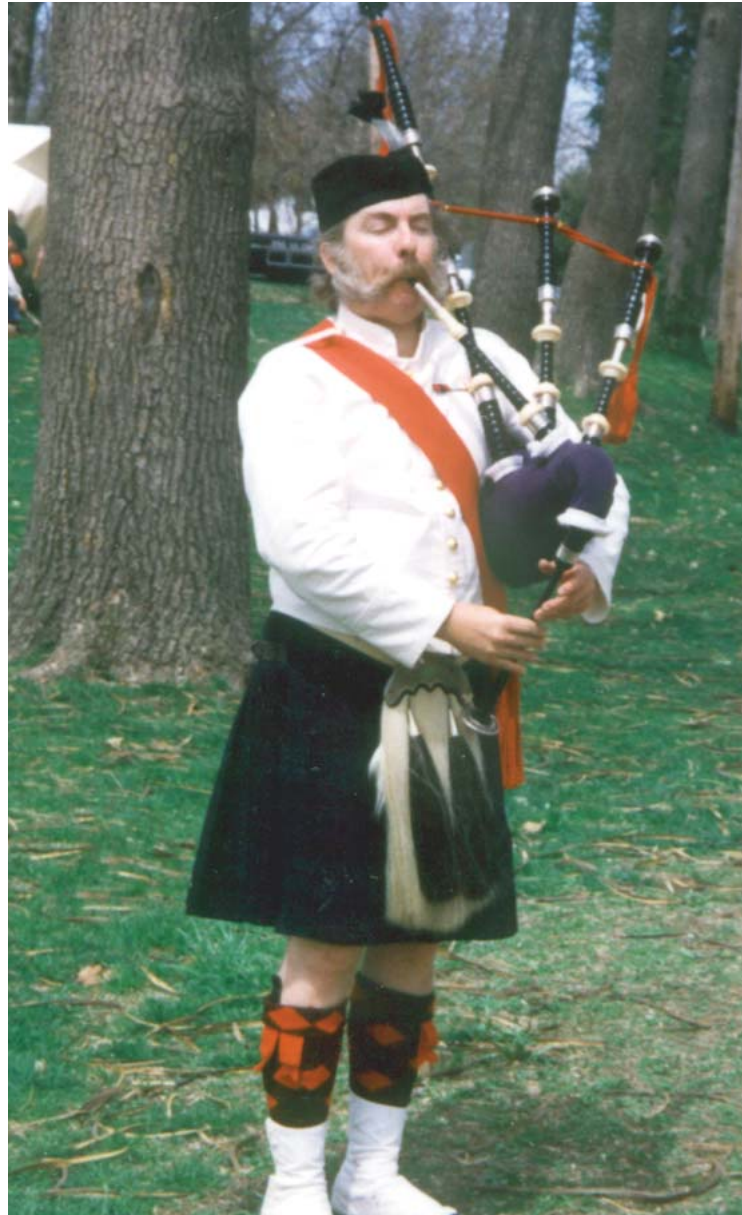
BE#3, Other Ranks Drill Order Jacket. Pipe Major, 93rd (Sutherland Highlander) Reg. Member of British observer group at Ft. Belvoir, outside Washington, D.C. August, 1862. This jacket issued 1853-1914.