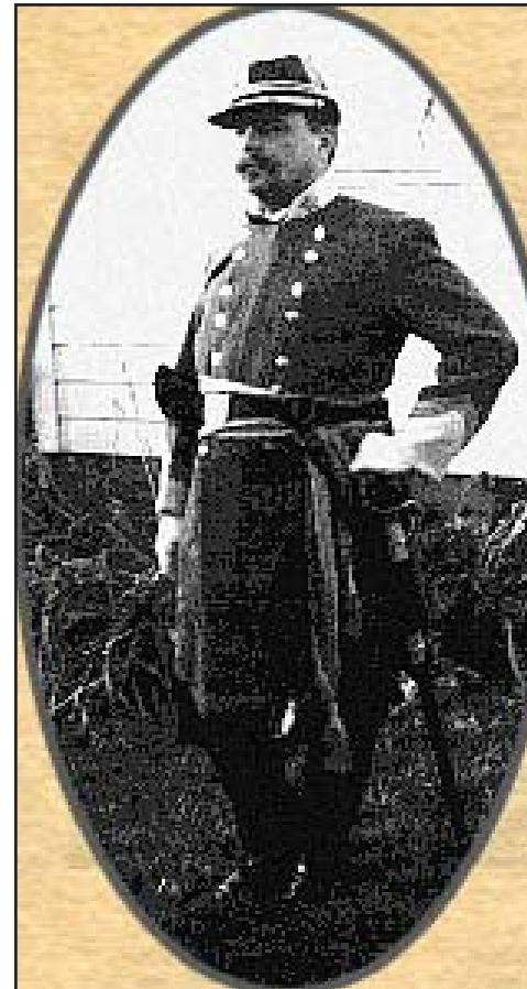
Confederate States Staff Officer

In General Order #9 (1861 Richmond Regs.), the basic prescribed uniform for the Confederate Regular Army was a tunic of cadet gray and trousers of "light (or sky) blue". This uniform, though issued in some quantities to the Regular Confederate Forces and to some state units was