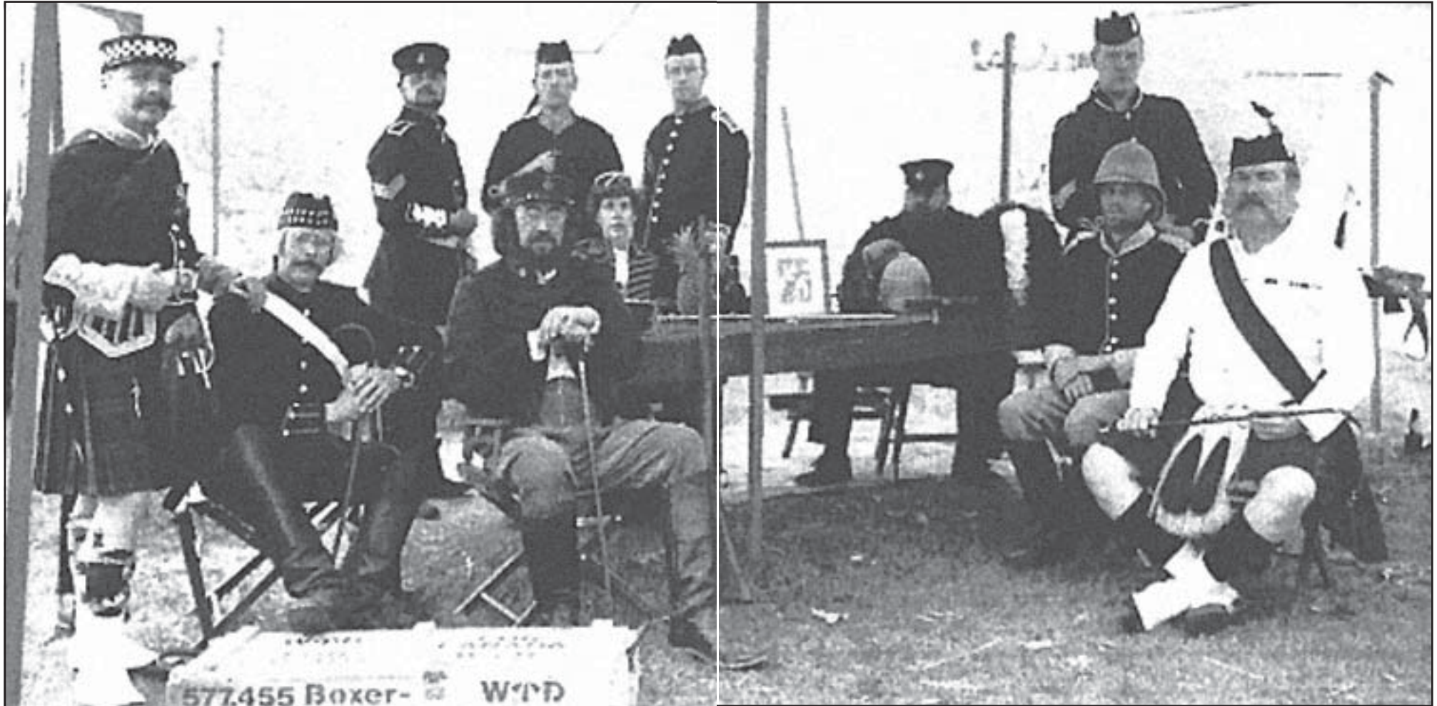
British Officers and their Servants, 1857-1870. Officers, left to right: (Standing) Major, 93rd (Sutherland Highlanders) Reg., (seated) Captain, 78th (Highland-Ross Shire Buffs) Reg. in drill order, (seated) Col., 2/60th (King's Royal Rifle Corps) Reg., (seated) Officer's Lady, Royal Horse Artillery, (seated) Lt., 1st (Royal Scots) Reg., (seated) Capt., 73rd (Perthshire) Reg. in drill

order, (seated) Pipe Major, 93rd (Sutherland Highlanders) Reg. in drill order.