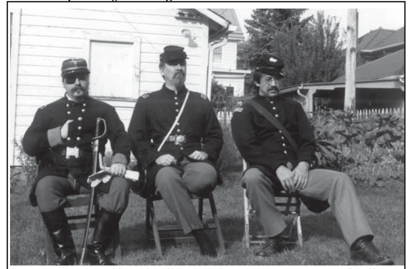
L to R: CWF# 9, Field Grade Officer's Frock Coat, CWF# 8, Co. Grade Officer's Frock Coats. Two of Maj. Gen. Ben Butler's Staff convalesce under their surgeon's caring eye @ Eppe's Plantation, City Point, Va, 1864.

CWF:14 Custom Officer's Shell Jacket: Many officers wore single or double breasted shell jackets with sleeve knots and breast frogging. Though not regulation, these were authorized for some officers and varied between individuals. Call or write for prices. Please include a description of what you'd like!