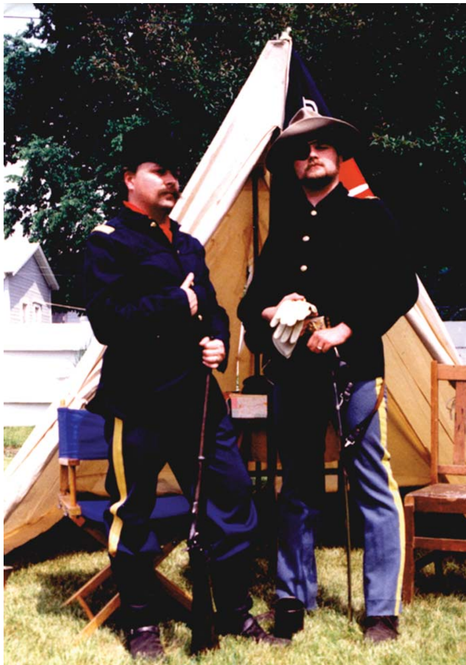
Left: CWF# 14, Officer's Undress Fatigue Blouse & CWF# 16, Officer's Trousers. Right: CWF# 15 M1875 Officer's Undress & CWF# 16 Officer's Trousers. Another wild night of husker-dooing for these Swedish boys in Fargo, Dakota Territory, June, 1876.

regiments used only a single loop of braid on the cuff such as the 28th (North Gloucester) Regiment of Foot. Please specify regiment. Pipe in white round bottom of collar, down front, rear skirt vents, and shoulder straps. Lined in cotton. $135.00