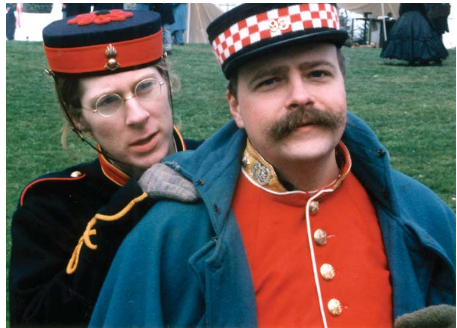
At left: BE# 28 M1855 Other Ranks Forage Cap, M1856 OR Tunic. At right: BE#30, Officer's M1855 Forage Cap, BE# 16, M1856 Highland Officer's Doublet. Pte of the Royal Artillery assists Highland Officer. Ft. Belvoir, 1862. Snails & Oysters?

Black oak-leaf braid band, bound leather visor, leather sweatband. Lined in cotton or silk-like acetate. Please specify. $70.00