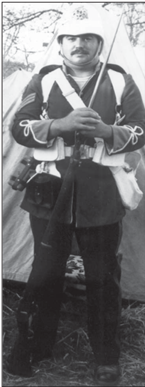
BE#11, M1877 OR Dress Tunic. Sgt. of the 24th (2nd Warwickshire) Reg., South Africa, 1879.