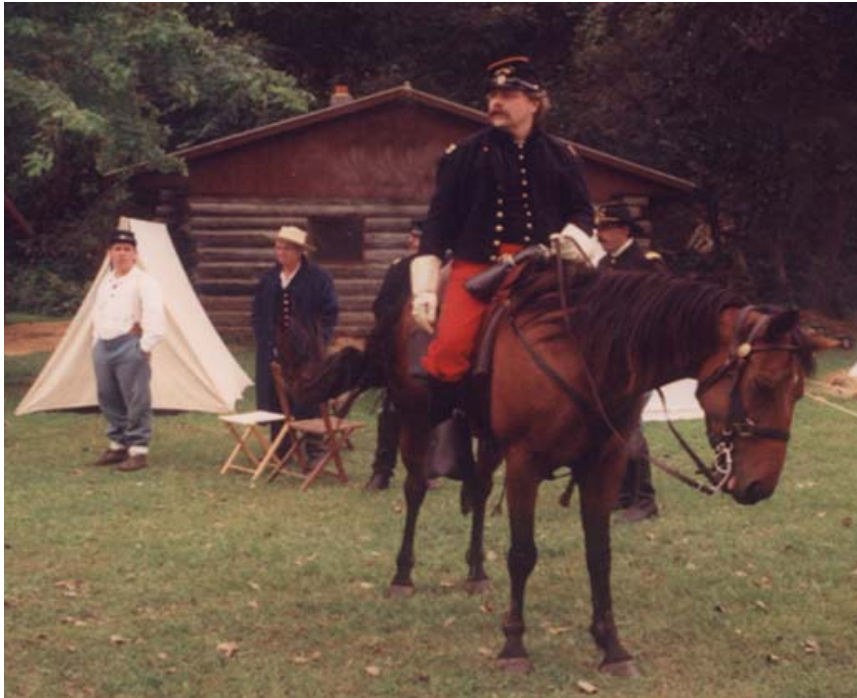
CWF#1: Mounted Services Jacket. Officer, 2nd U.S. Dragoons, 1858-66.

CWF:1 M1854 Mounted Services Jacket: Waist length shell jacket, dark blue wool broadcloth, 12-button front, 2 buttons on split cuff. Two false buttonholes on collar, twin bolsters in rear. Lined in black cotton (silesia) and trimmed in \frac{3}{8} " braid in branch color, viz; yellow (Cavalry), orange (Dragoons), green (Mounted Rifles), scarlet (Light Artillery) all per regs. $95.00