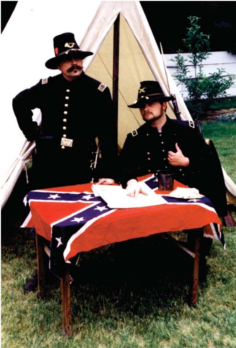
CWF# 8, Co. Grade Frock Coat & CWF #10, General Officer's Frock Coat. Gen. U.S. Grant's Staff Officers assess medicinal whiskey stocks, Petersburg, June, 1864

Lieutenant-general: Available on request.